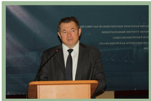
Sergey Glazyev , Member of the Russian Academy of Sciences, Chairman of the Academy's Council on Comprehensive Problems of Eurasian Economic Integration, Modernization, Competitiveness, and Sustainable Development

We should always bear in mind that neoliberalism has acquired a new lease of life and is aimed at fragmenting the region, destroying all that has been achieved in the field of regional integration, creating unprecedented and domineering chains of the so-called new knowledge economy and its agreements on intellectual property, in order to perpetuate the technological dependence of peripheral countries and impose on them their ideological products, says the correspondent of Prensa Latina.