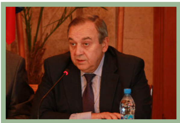
Georgy Muradov , Deputy Chairman, Council of Ministers, Republic of Crimea, Permanent Representative of Republic of Crimea to the President of Russia (Russia)

I suggest that in the course of our conference we not only present reports but also share our views and evaluations.