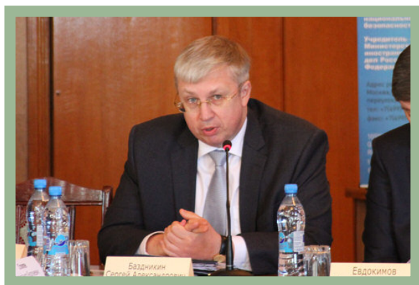
Sergey Bazdnikin , Deputy Director, Foreign Policy Planning Department, RF Ministry of Foreign Affairs

All this means a major role for the proposed Economic Belt of the Silk Road of Innovations - 21st Century as a new platform for bilateral and multilateral cooperation in the integration of the EAEU with the Silk Road Economic Belt, a program propounded in the Joint Statement of the Russian Federation and the Chinese People's Republic.