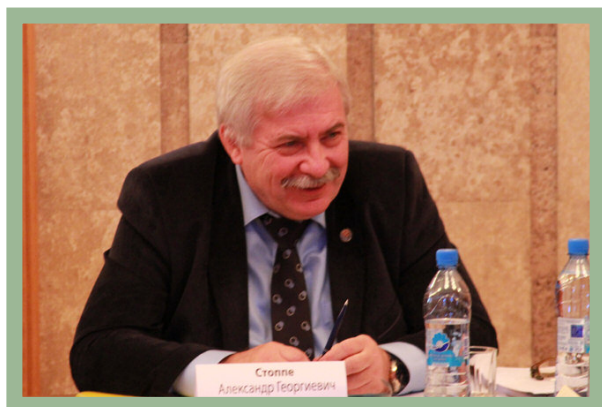
Alexander Stoppe , Head of the Analytics Department at the Permanent Committee of the Union State of Russia and Belarus (Russia)

UNIFICATION with a high level of economic integration on an economic basis alone has its limits, and without elements of trust, humanitarian bonds, and cooperation in countering shared threats and challenges, unification processes may also be restricted.