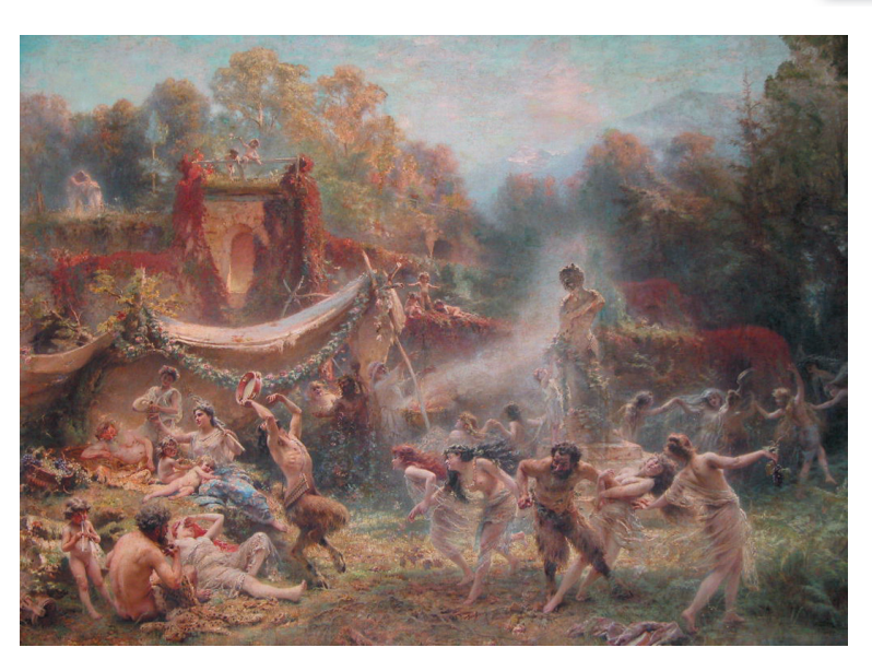
"Spring Bacchanalia" by Konstantin Makovsky

Makovsky (1839-1915) began in Indonesia.<sup>4</sup> Judging by the size of the canvases (close to 18 square meters each), this work was not an easy one.