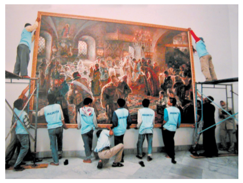
The painting "Sprinkling with hops" by Konstantin Makovsky dismantled for restoration